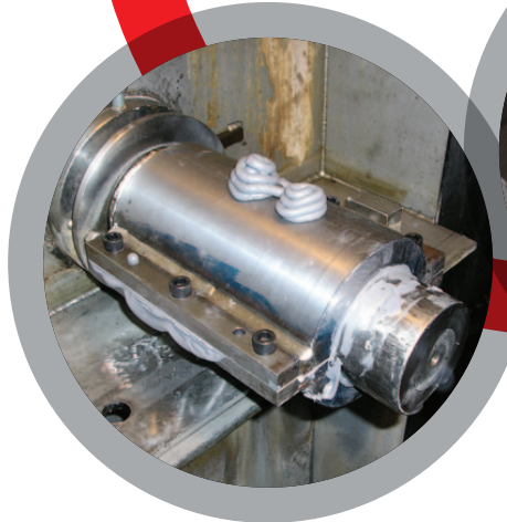
In-situ Shaft Forming