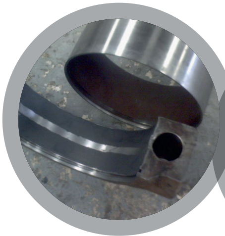
Bearing Housing Rebuild